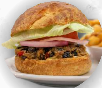
BLACK BEAN BURGER