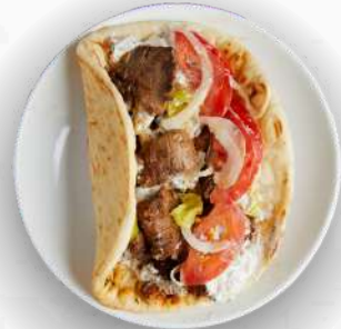
BEEF & LAMB GYRO