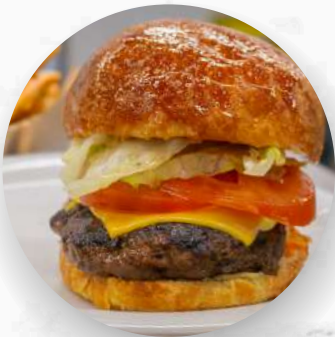
COMMONWEALTH SIGNATURE BURGER